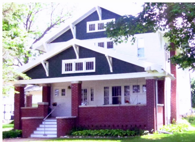
The Purdy Home today